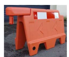
Stackable Water Filled Barrier