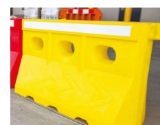
Interlocking Water Filled Barrier