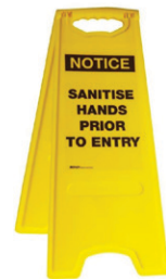
Sanitise Hands Prior To Entry Deluxe Floor Stands Notice