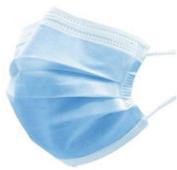
Disposable L2 Face Mask, Pack of 50 - Blue

Whether it's face masks, safety glasses or gloves, we stock essentials to help protect workers and visitors from hazards. Require Bulk? Call us to discuss today.