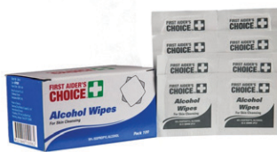
FAC Alcohol Wipes - Pack of 100

From first aid room equipment, antiseptics to adhesive strips, we have everything for your daily first aid needs.