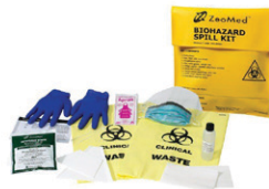
Biohazard Clean Up Kit