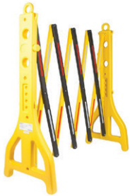
2.4m Expanding Barrier Economy Plastic

With more people on-site, it's important to implement directional prompts to ensure people move around sites efficiently.