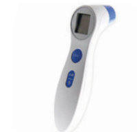
Infrared Non-Contact Forehead Thermometer