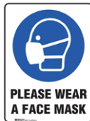
Face Mask Signs