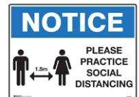
Social Distancing Signs

Require a custom sign? Call us or design online at BradyID.com.au/custom