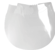
Promeg Disposable Face Shield - Pack of 50