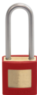
BACK WITH OPTIONAL ENGRAVING