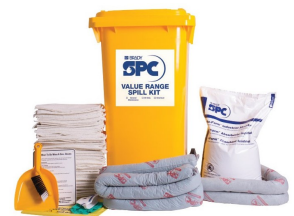
Value 195L General Spill Kit